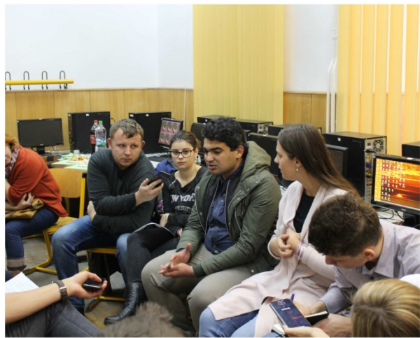
Discussions and interview with the 2 Syrian refugees.