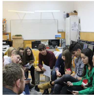
Interviewing the 2 Syrian refugees in the meeting at our school